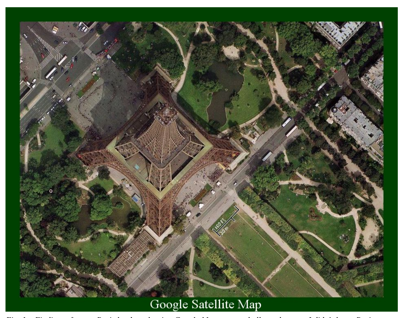
Fig. 1 – Finding a famous Paris land mark using Google Maps was a challenge because I didn't know Paris.

I was "playing" with Google maps and I "captured" the image shown in figure one. It is heavily "processed" and prints nicely full page on photo paper. You may clearly see a line of people waiting in line at the top left.